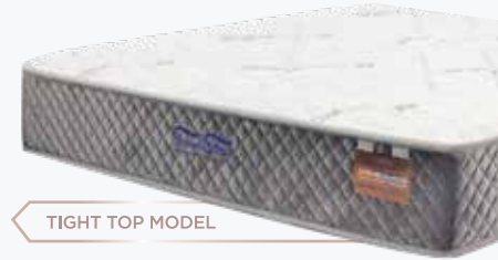
TIGHT TOP MODEL

Tight Top Design 5 Zones Individual Pocketed Spring System Foam Encasement + Firm Edge Aire Flex™ Technology 18 cm Spring Height Mattress Height: 10"/ 25cm