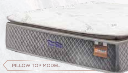
PILLOW TOP MODEL

5 Zones Individual Pocketed Spring System Foam Encasement + Firm Edge Aire Flex™ Technology Natural Latex Gel Infused Memory Foam High Density Foam 22 cm Spring Height Mattress Height: 13"/ 34cm