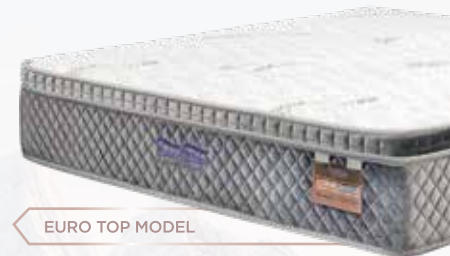
EURO TOP MODEL

5 Zones Individual Pocketed Spring System Foam Encasement + Firm Edge Aire Flex™ Technology Natural Latex 18 cm Spring Height Mattress Height: 12"/ 30cm