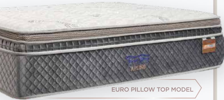
EURO PILLOW TOP MODEL