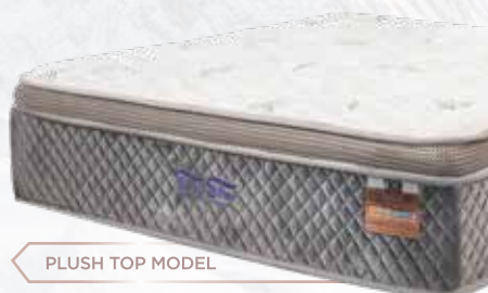
PUSH TOP MODEL

5 Zones Individual Pocketed Spring System Foam Encasement + Firm Edge Aire Flex™ Technology Natural Latex (Dual layer) Gel Infused Memory Foam High Density Foam 22 cm Spring Height Mattress Height: 14"/ 36cm